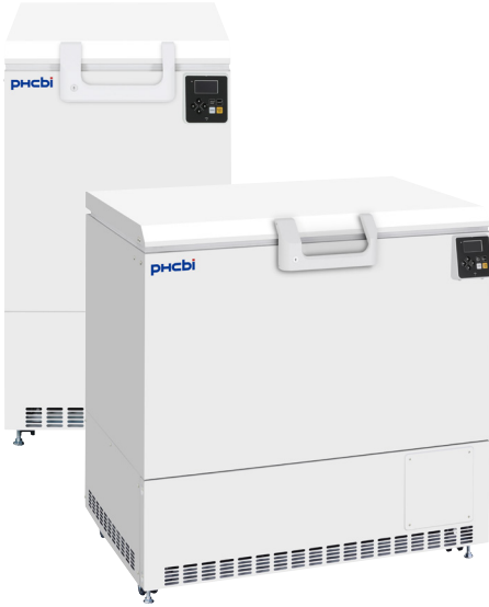
MDF-DC102VH-PE / MDF-DC202VH-PE