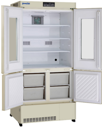
MPR-715F-PE with optional MPR-715SC-PW