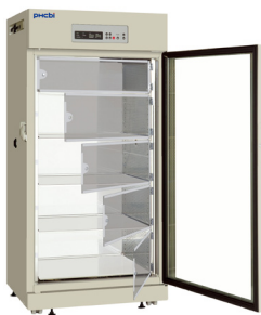
MCO-80IC with optional inner door kit (MCO-80ID-PW)